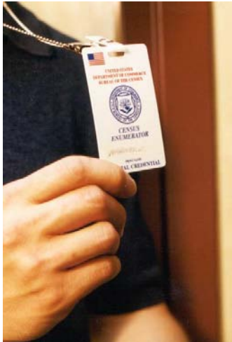
Census workers wear an official identification badge which may or may not have a picture