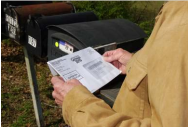
Most census forms will arrive in the mail, prominently displaying the "Census 2010" logo