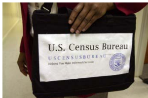
Many census workers carry U.S. Census Bureau bags, making them easier to identify